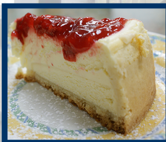
Caramel Crunch.....4.75 Galaktoboureko.....3.95 Cherry Cheese Cake...4.75