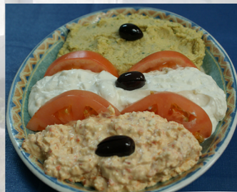
Delicious Mediterranean Dips

All of the above served with two pita breads