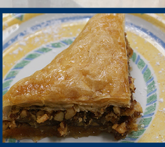
Chocolate Truffle.....4.75 Cookies and Cream...4.75 Baklava.....3.75